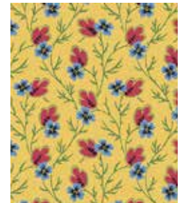
8046-RY 1 1/4 yds