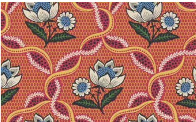
8044-R 3/4 yds