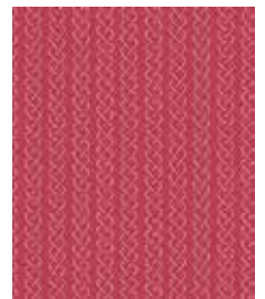
8048-R 1 1/4 yds (includes binding)