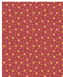
8047-KR 3/4 yd