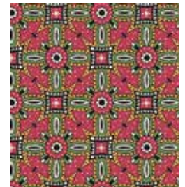
8045-R 2 1/4 yds (extra yds needed for backing)